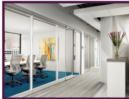
Conference Room Hallway